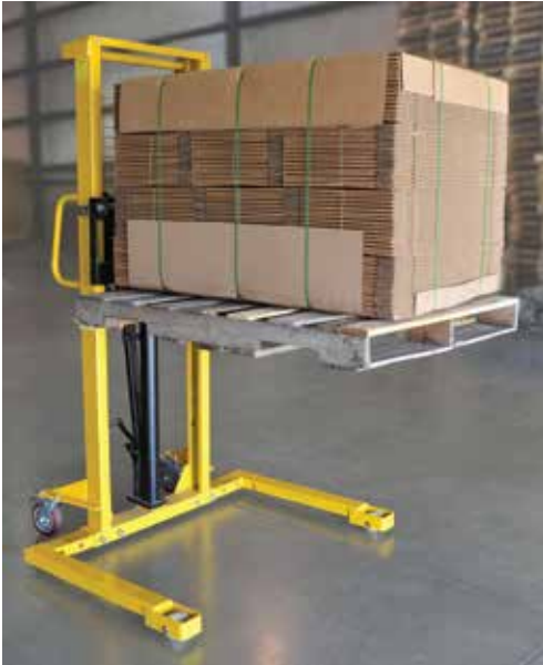
Adjustable stabilizing arms slide in/out for storage