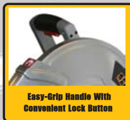
Easy-Grip Handle With Convenient Lock Button