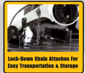
Lock-Down Chain Attaches For Easy Transportation & Storage