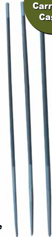
Round Fine Tooth Files