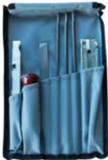
Depth Gauge Filing Guide