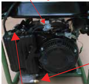
LP Gas Inlet (Figure B)