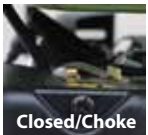
Choke (Figure C)