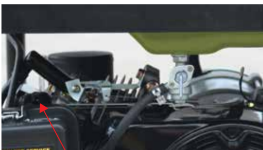
Choke (Figure B)