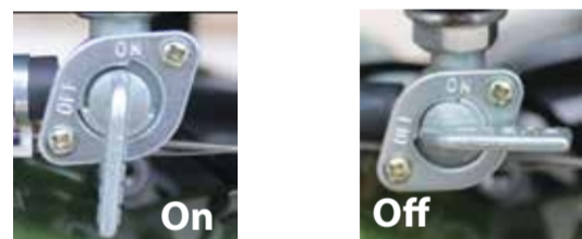
Fuel Petcock (Figure A)